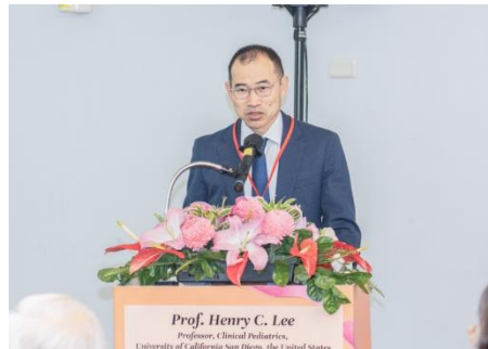
Keynote speaker Prof. Henry C. Lee shares experiences for minimizing preventable infant deaths.