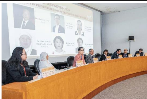
Panel Discussion- Experience Sharing among APEC Economies