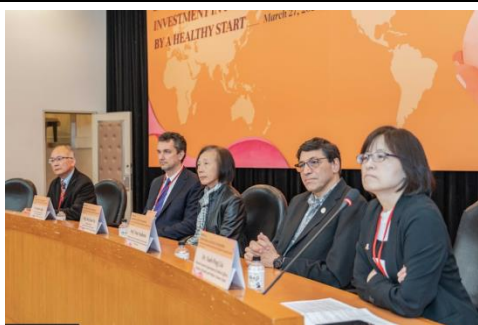
Plenary 1- Panel discussion