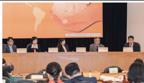
Plenary 2- Panel discussion