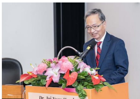
Dr. Jui-Yuan Hsueh, Minister of Ministry of Health and Welfare makes an opening remark to welcome APEC economies representatives, experts from public health.