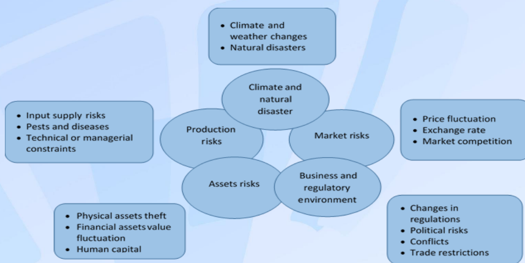
Figure 3: Risks in the Food Value Chain