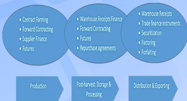
Figure 2: Variety of Finance Instruments Along the Food Value Chain